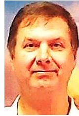
Director Pan America