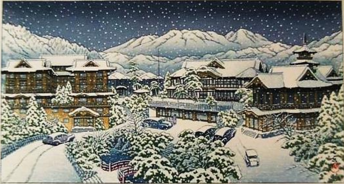
Kawase Hasui: Fujiya Hotel, Miyanoshita, Winter