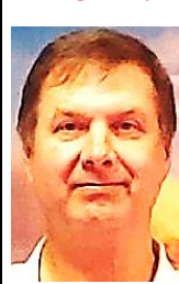
Director Pan America