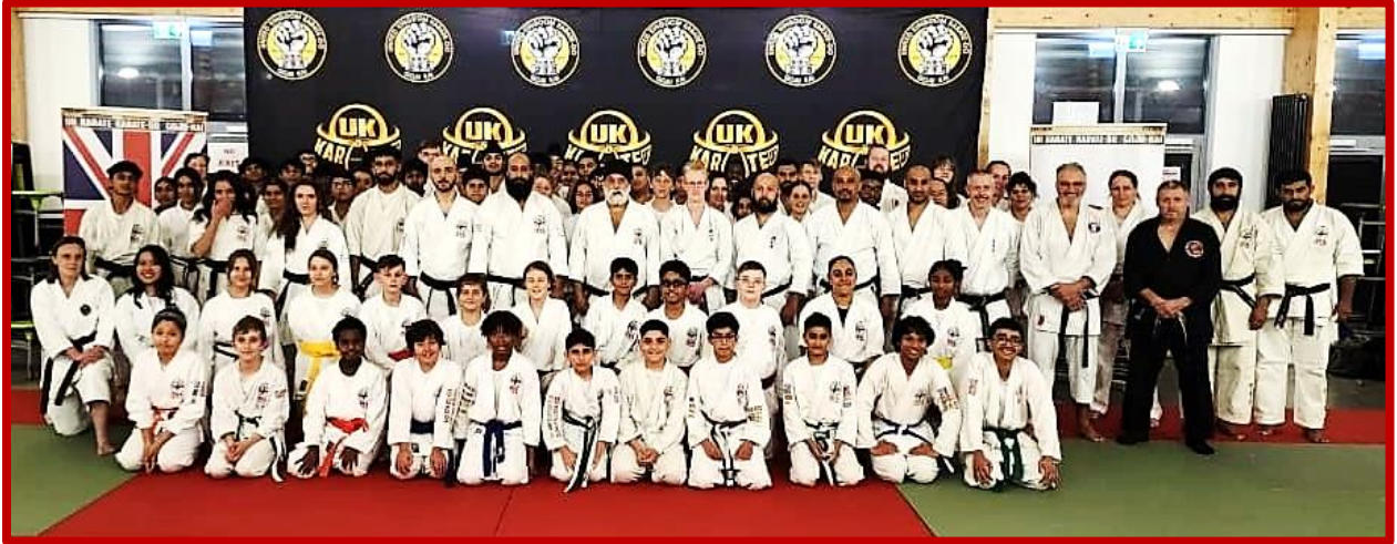
The West London Seiwakai Seminar (29 Oct '23) was well attended by over 85 members from Manchester, Oxford, East London, and West London.