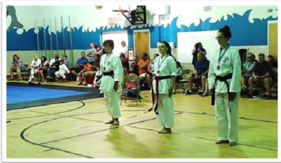
Above: Gold, Silver, and Bronze medalists in the 13 to 14 year old girls kata division

The Sunday, June 1 Friendship tournament had 53 competitors and all but a few were Seiwa Kai Students.