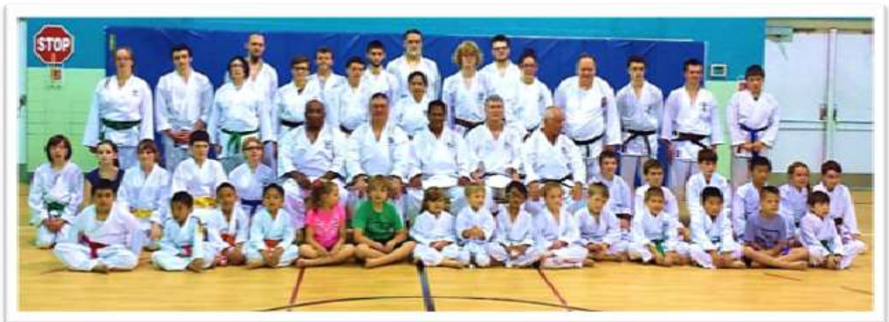
The Saturday May 31 seminars were open to all, and 53 Seiwa Kai Students attended. (Most Attendees are in the photo above.)