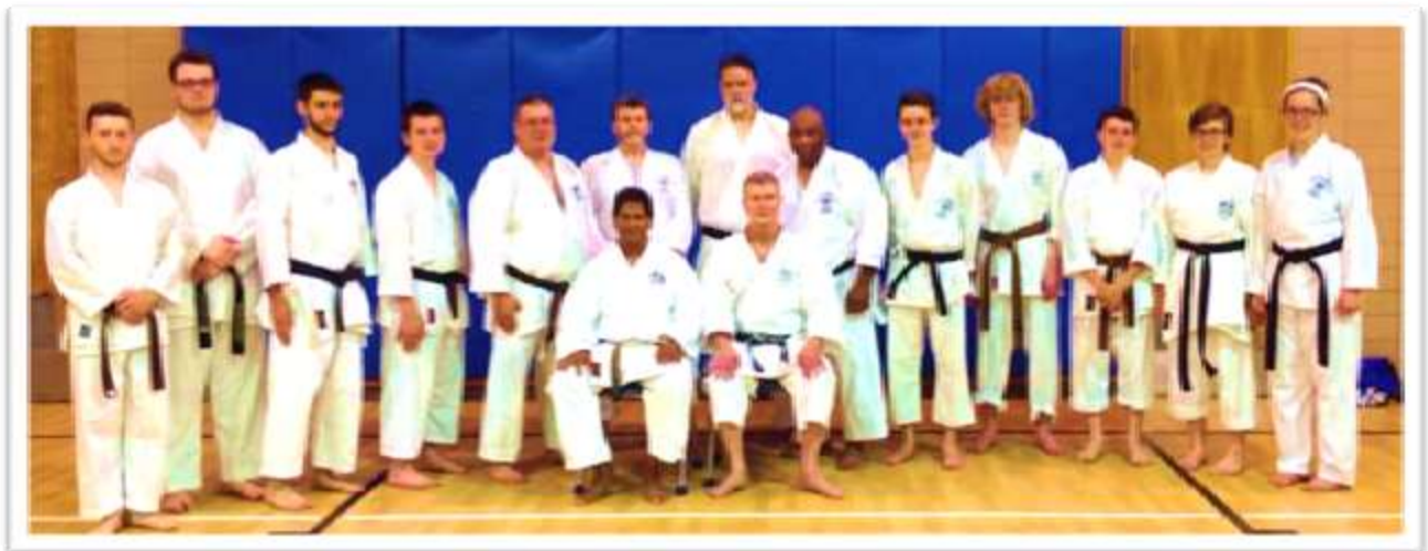
The Friday May 30 seminar was reserved for brown and black belts.