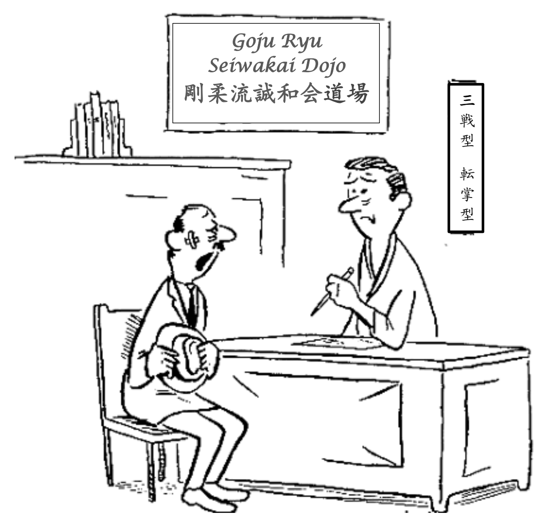
Actually, I was referred to your dojo by my marriage counselor.