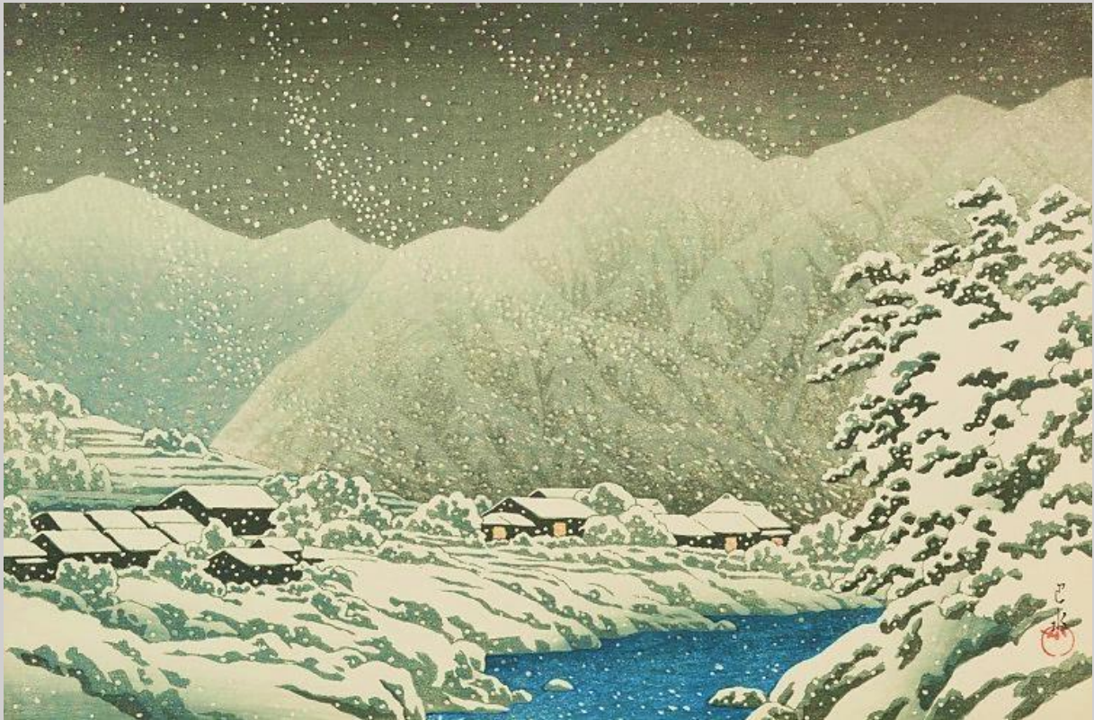
Woodblock Print by Kawase Hasui 1924 – Nakayama Seven League Road, Hida